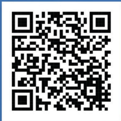
Facebook Maaedicare Charitable Foundation

AND WE WILL GIVE YOU GREAT TIPS, ADVICE, NEWS, AND WHO KNOWS, MAYBE EVEN PRIZES AND GIFTS.