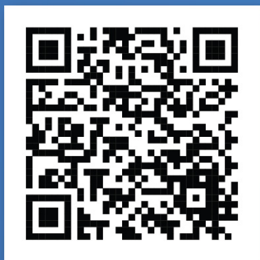
Facebook Maaedicare Charitable Foundation

AND WE WILL GIVE YOU GREAT TIPS, ADVICE, NEWS, AND WHO KNOWS, MAYBE EVEN PRIZES AND GIFTS.