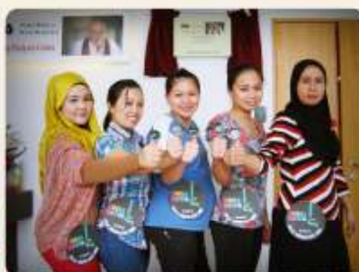
• Dress down day ( nationwide )