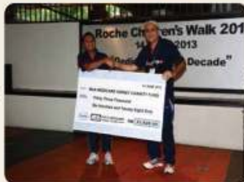
• Roche Childrens' walk 2013 ( KL )