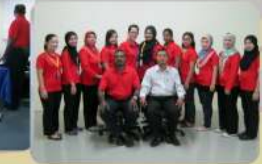
• Medical Executive Training