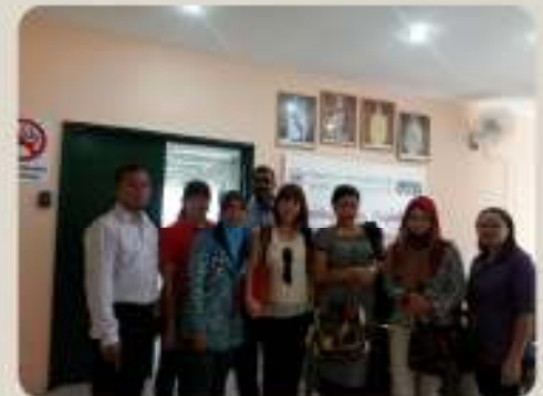
• Management Training