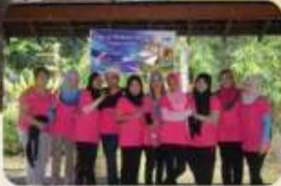
• "Happy Together" (Johor Bahru)