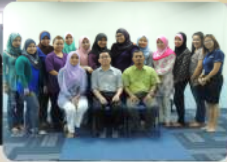
• Leadership Training (JB1)