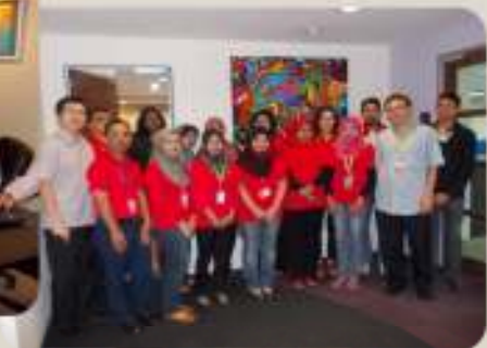
• Admin Assistant Training