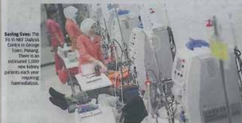
Saving lives: The Fo Yi-NK Dialysis Centre in George Town, Penang. There is an estimated 5,000 new kidney patients each year requiring haemodialysis.

Thousands face health risk as govt funding is not approved