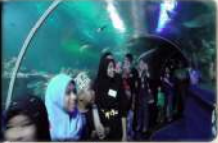
• Visit Petrosains & Aquaria KLCC (Klang Valley centres)