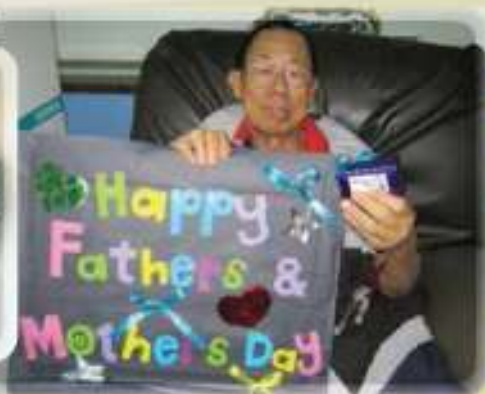
• Birthday, fathers' day, mothers' day celebration for patients