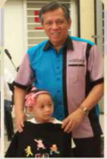
• Kids@medicare (Kota Kinabalu)