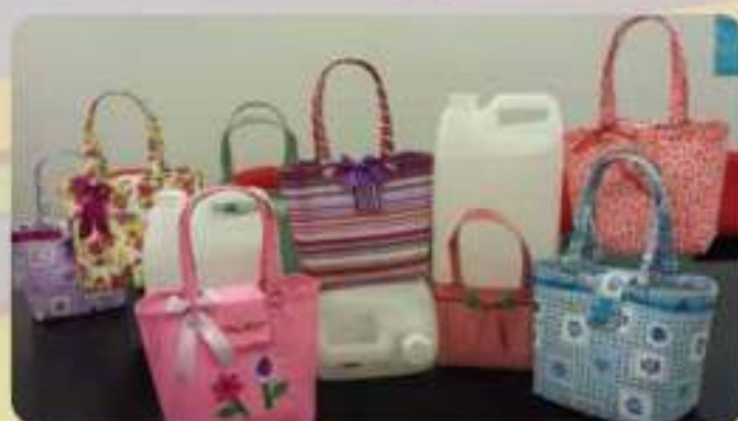
• Bags made from Bicarb bottles ( KK )