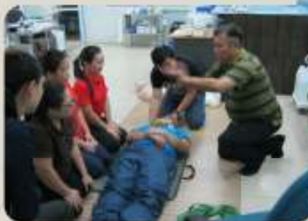
• CPR Training (Kota Kinabalu)