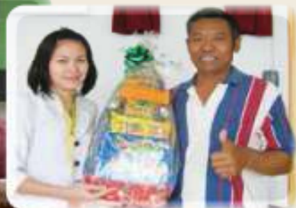
• Groceries / medical items for patients