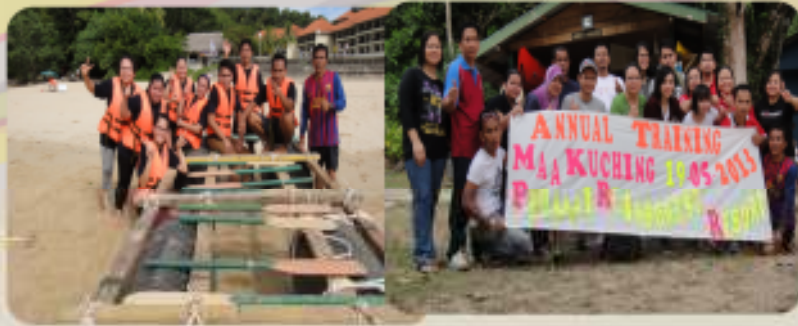
• Team Building At Permai Reinforest Resort (Kuching)