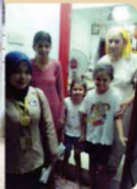
• Home visits