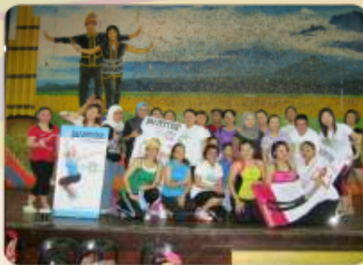
• Jazzercise ( nationwide )