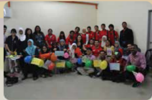
• APU students visit