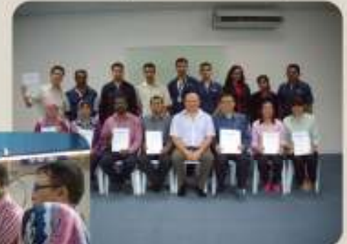
• Water Champion Training by Fresenius