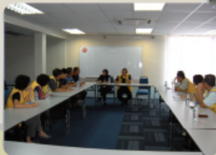
• Study visit by JB Lions