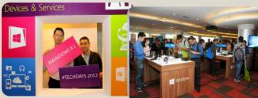
• Microsoft Tech Day 2013