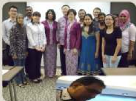
• MIRCERA Talk by Roche (Ipoh)