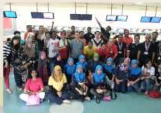
• Bowling for Charity ( KL )